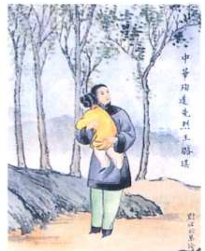
St. Lucia Wang-Wang 1869 - 1900

At that time, there were many non-Catholic bystanders. Seeing the lovely 9-year old child, St. Andrew Wang Tianqing, many bystanders offered adoption. However, her mother, St. Lucia Wang-Wang, tightly holding her son, told the bandits firmly, "I am a Catholic. My son is also a Catholic. If you want to kill me, kill us both. Please kill my son first. Then, kill me next."