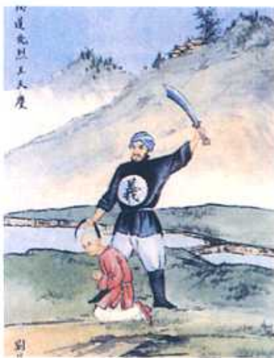
St. Andrew Wang Tianqing 1891 - 1900

The sky was getting darker. The bandits lit up few candles that were stolen from the church. St. Anna Wang told her companions: "These candles are from the church. Look how beautiful these flames are! However, the glory of heaven is a billion, billion times more glorious than these beautiful flames!" She led everyone in the evening prayers, which turned out to be their last ones.