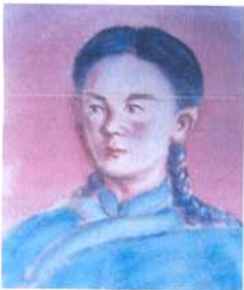
St. Anna Wang 1886 - 1900

Anna replied with dignity and courage: "I will never leave my religion. Besides, I am already betrothed." Pointing to the Wei village, she continued: "I have been betrothed to the Wei village". In fact, she meant that she had dedicated herself to the Church in the Wei village, which is the bride of Jesus."