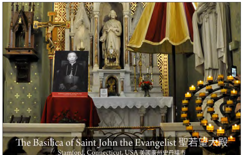
The Basilica of Saint John the Evangelist 聖若望大殿 Stamford, Connecticut, USA 美國康州史丹福市